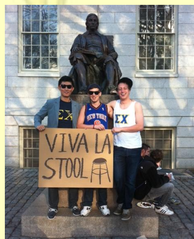
Kappa Eta bros repping Harvard and ΣΧ on Barstool