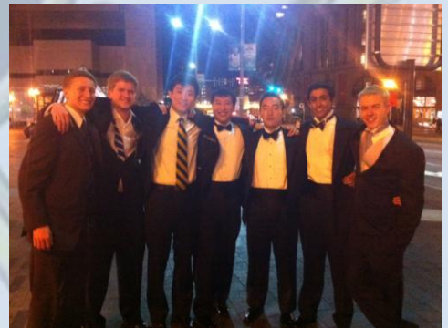
Another formal pic. Can you spot three glowing Asians?